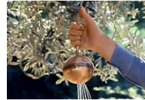
Carl Sagan's reconstruction of water thief http://kiwihellenist.blogspot.com/2018/11/cosmos-2-ionians-and-others.html